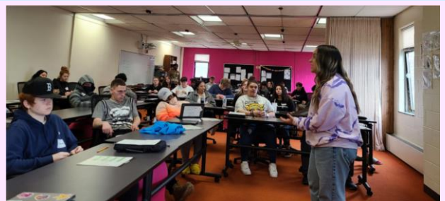
GoodLife at Online EDGE